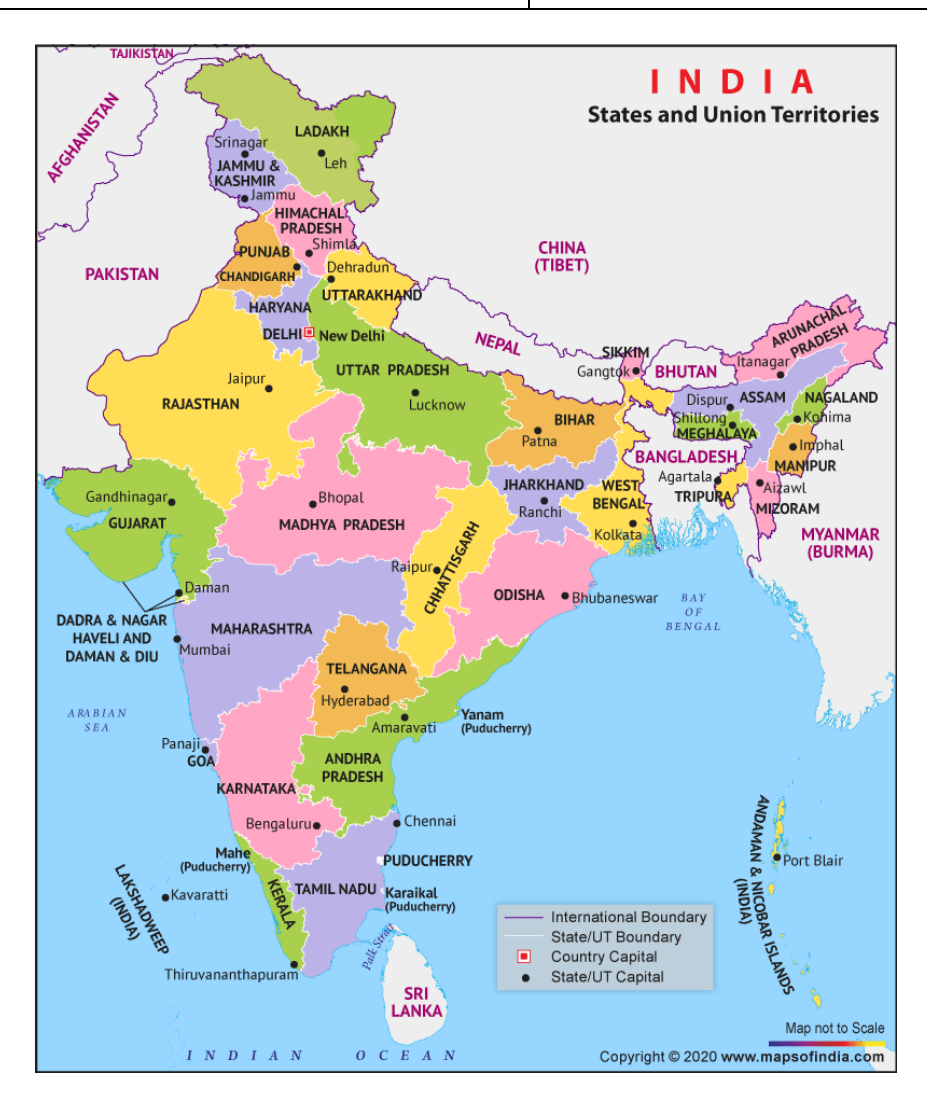
Figure 1: Map of India<sup>1</sup>