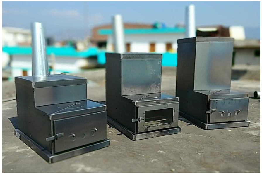
Figure 3: ECO1, ECO2 an ECO3

The emissions accounted from the various sources in the physical boundary of the project activity are as follows: